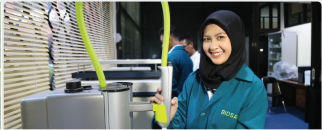
Food Engineering Technology (DIV– FET)

*Above are study programs supported by S4C project.