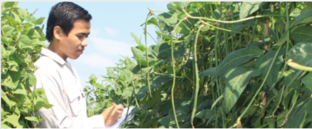
Food Industrial Technology (DIII – FIT)