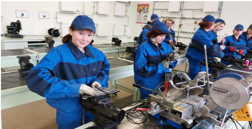
Plumbing students during their practical training

PUBLIC PRIVATE PARTNERSHIP TO IMPROVED PROFESSIONAL EDUCATION IN UKRAINE is a project of the Swiss Agency for Development and Cooperation SDC in partnership with Geberit Trading LLC, Sika Ukraine LLC implemented by Swisscontact with the support of the Ministry of Education and Science of Ukraine.