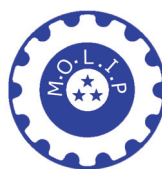
Ministry of Labour, Immigration and Population (MoLIP)