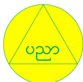
Ministry of Education (MoE)