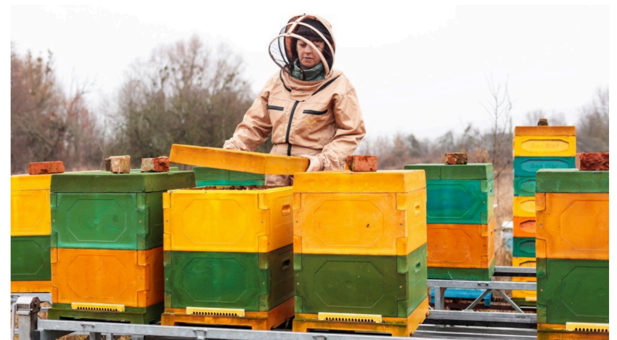
In Ukraine, Empower AgriWomen is helping women beekeepers turn local know-how into sustainable income.

The tenth-anniversary DC dVET workshop brought together vocational education stakeholders from across the region. Albania's Skills for Jobs project was selected as one of the DC dVET Spotlight Projects while Kosovo's Match Skills to Jobs initiative shared lessons on vocational education reform, dual VET and private sector engagement. Together, these exchanges highlight the value of peer learning, demonstrating how knowledge, experience, and practical solutions can be shared and adapted across different contexts.