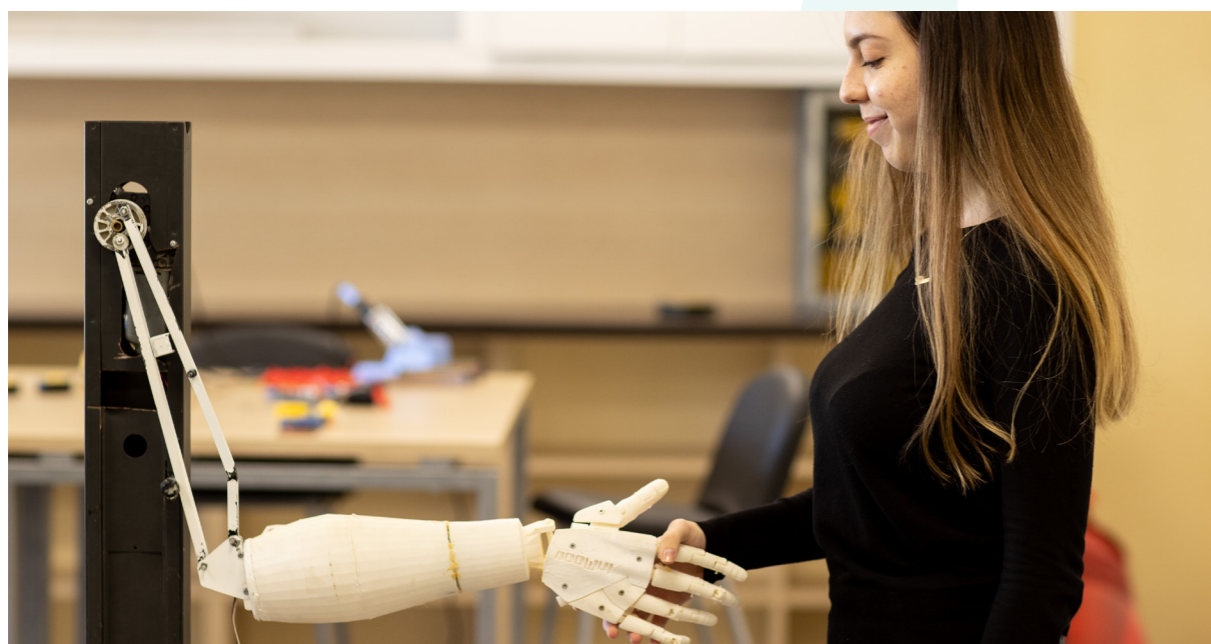
Startups are building a more innovative, competitive Eastern Europe.

50 active mentors engaged across the ecosystem