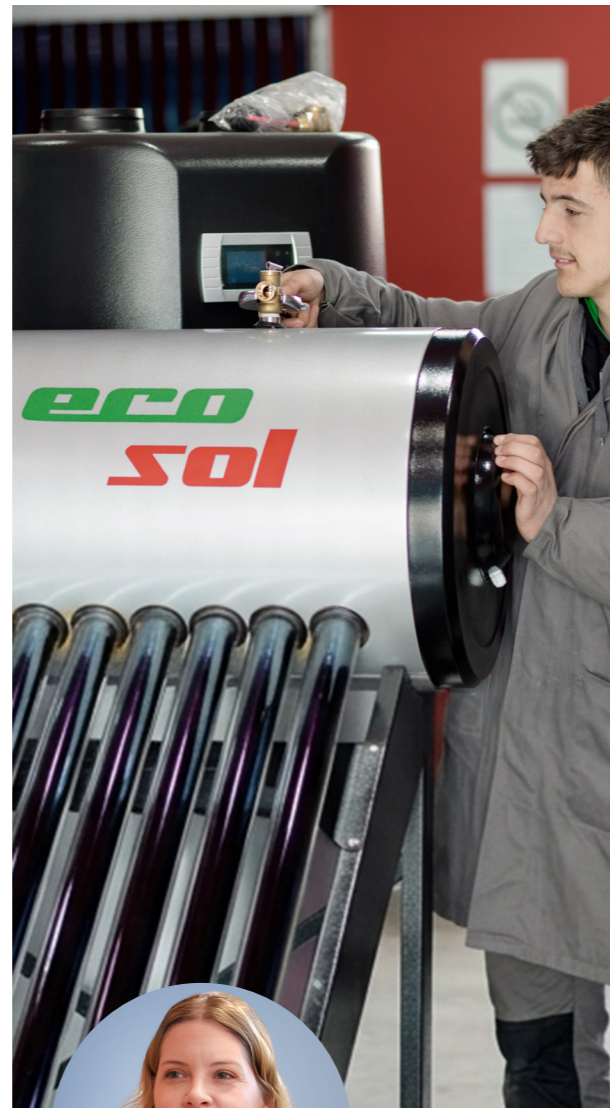
Students in Albania get the skills to build careers in green jobs.

In Ukraine, resilience takes on an even deeper meaning. The ability of education systems, businesses and communities to continue functioning under extreme conditions highlights the importance of systems that can adapt and continue creating opportunities during times of crisis.