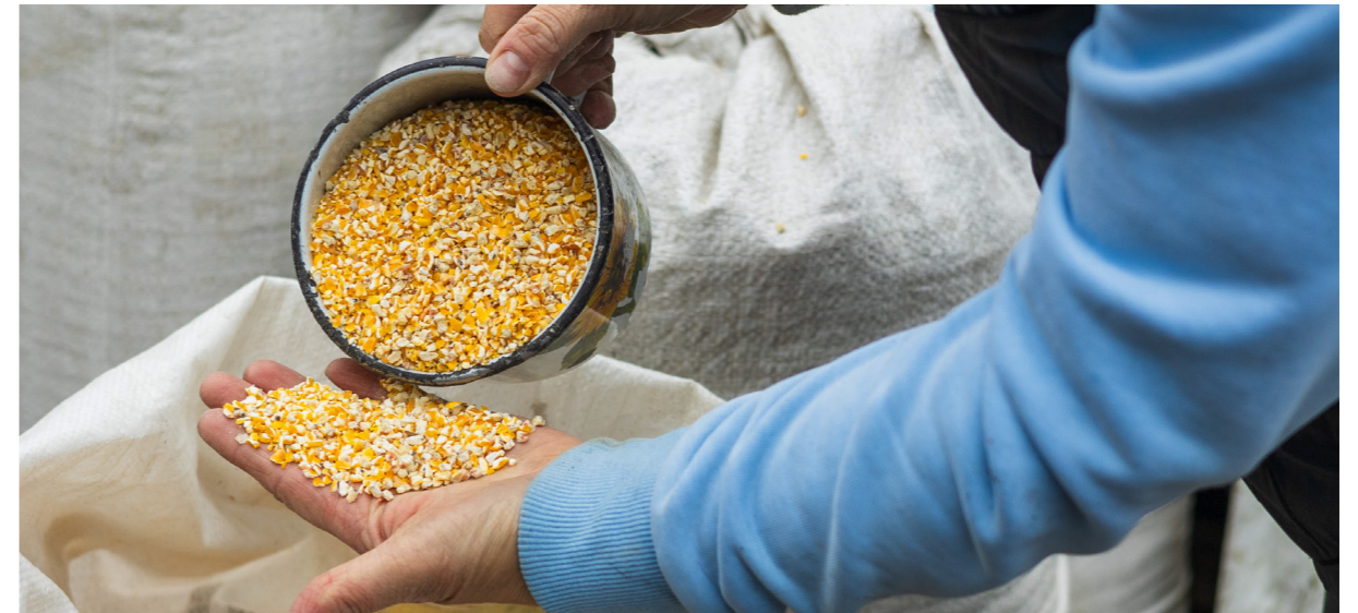
In Ukraine, Empower AgriWomen supports women farmers growing resilient livelihoods.