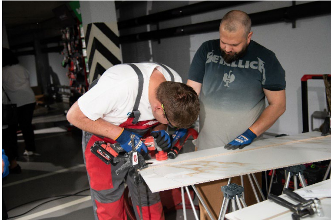
VET school teachers during their practical training

PUBLIC PRIVATE PARTNERSHIP TO IMPROVED PROFESSIONAL EDUCATION IN UKRAINE is a project of the Swiss Agency for Development and Cooperation (SDC) in partnership with Geberit Trading LLC, Sika Ukraine LLC implemented by Swisscontact with the support of the Ministry of Education and Science of Ukraine.