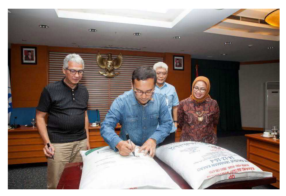
Figure 13: Launching cocoa specific fertilizer

Through capacity building skills activities and strategic lobbying/advocacy planning, executive office personnel proved their ability to bring together private and public sector cocoa stakeholders at all levels to accomplish something very special. Not only will the success of the cocoa-specific fertilizer initiative positively impact cocoa farmer families, but it also helped CSP gain recognition, setting a precedent for more initiatives in the future.