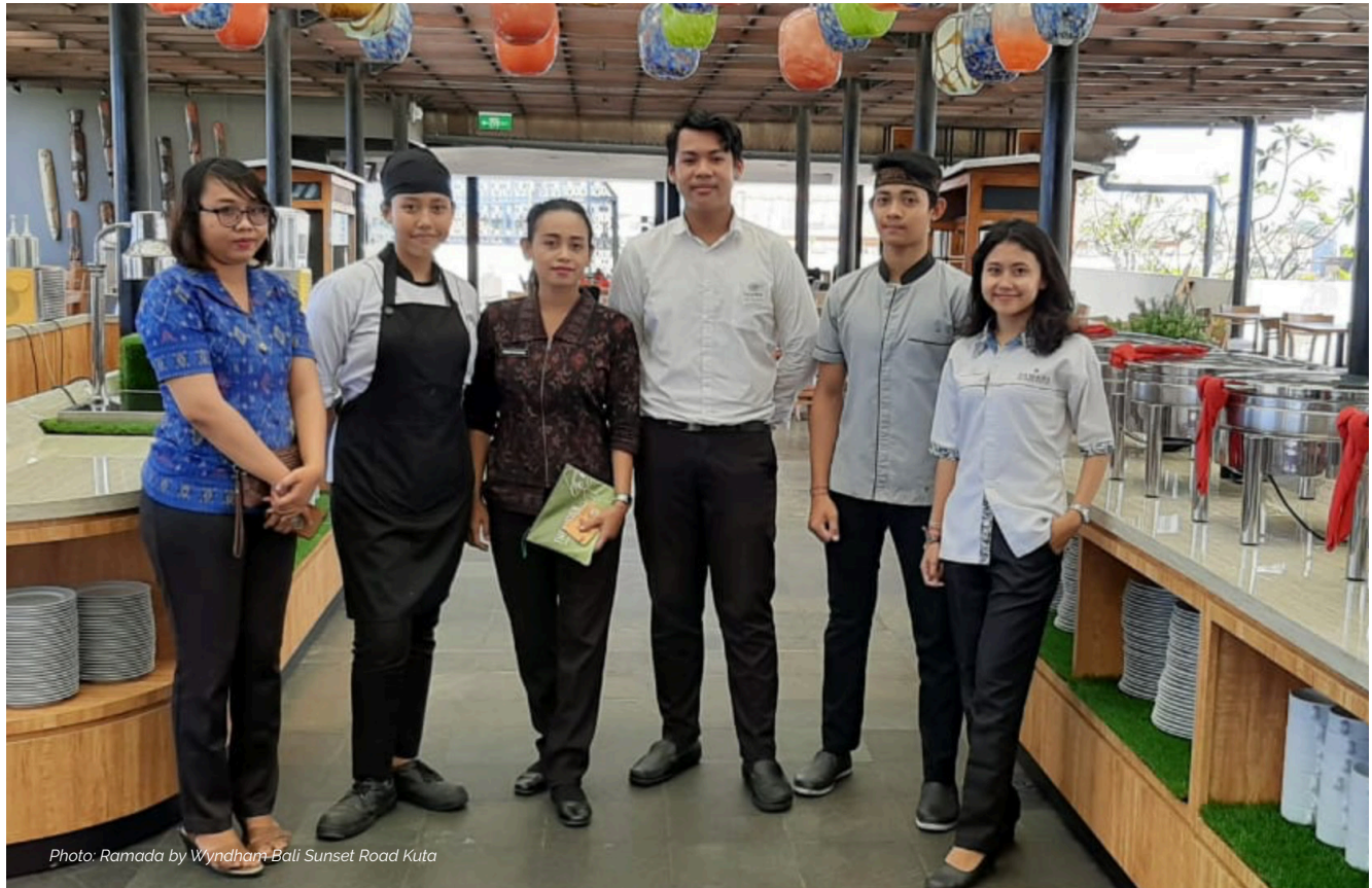
Photo: Ramada by Wyndham Bali Sunset Road Kuta

In 2020, this Industry Class program was continued in collaboration with SUSTOUR, as part of which the State Vocational School (SMKN) 3 Denpasar and Ramada by Wyndham Bali Sunset Road Kuta would both act as mentors and guides for other vocational schools and industry in the preparation and implementation of a Link & Match Industry Class.