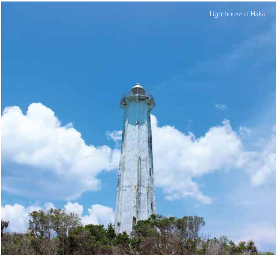
Lighthouse at Haka