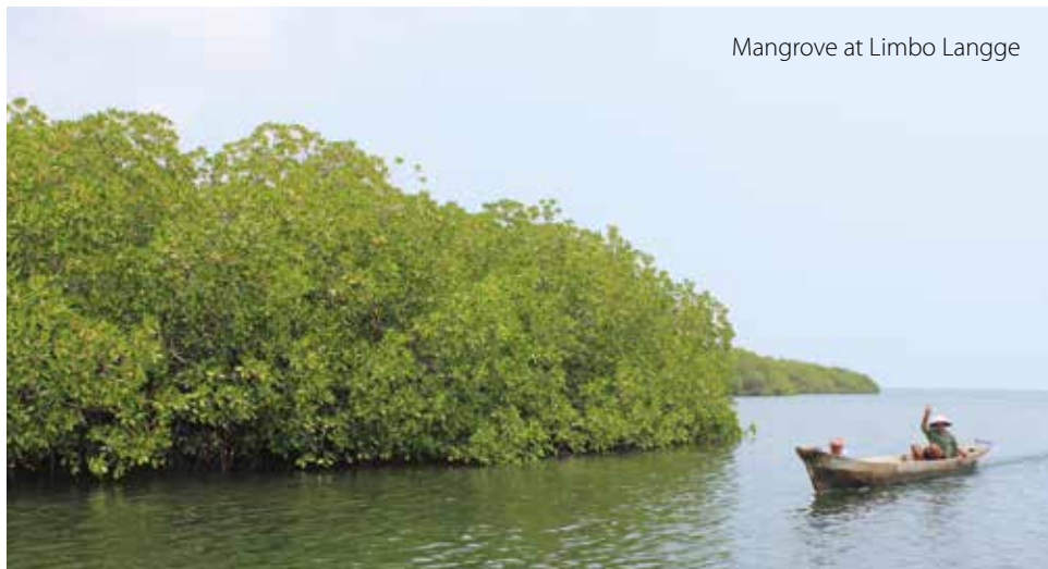
Mangrove at Limbo Langge