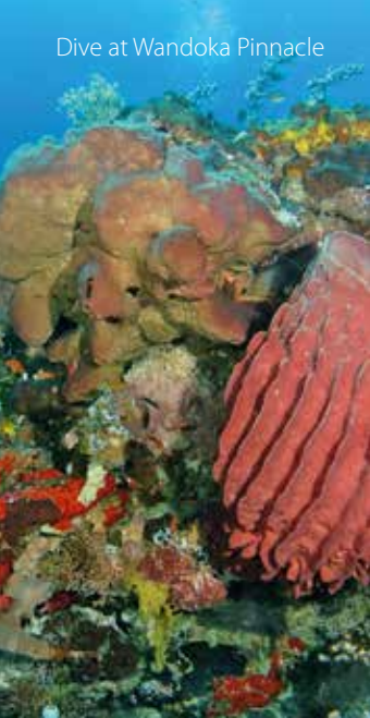
Dive at Wandoka Pinnacle