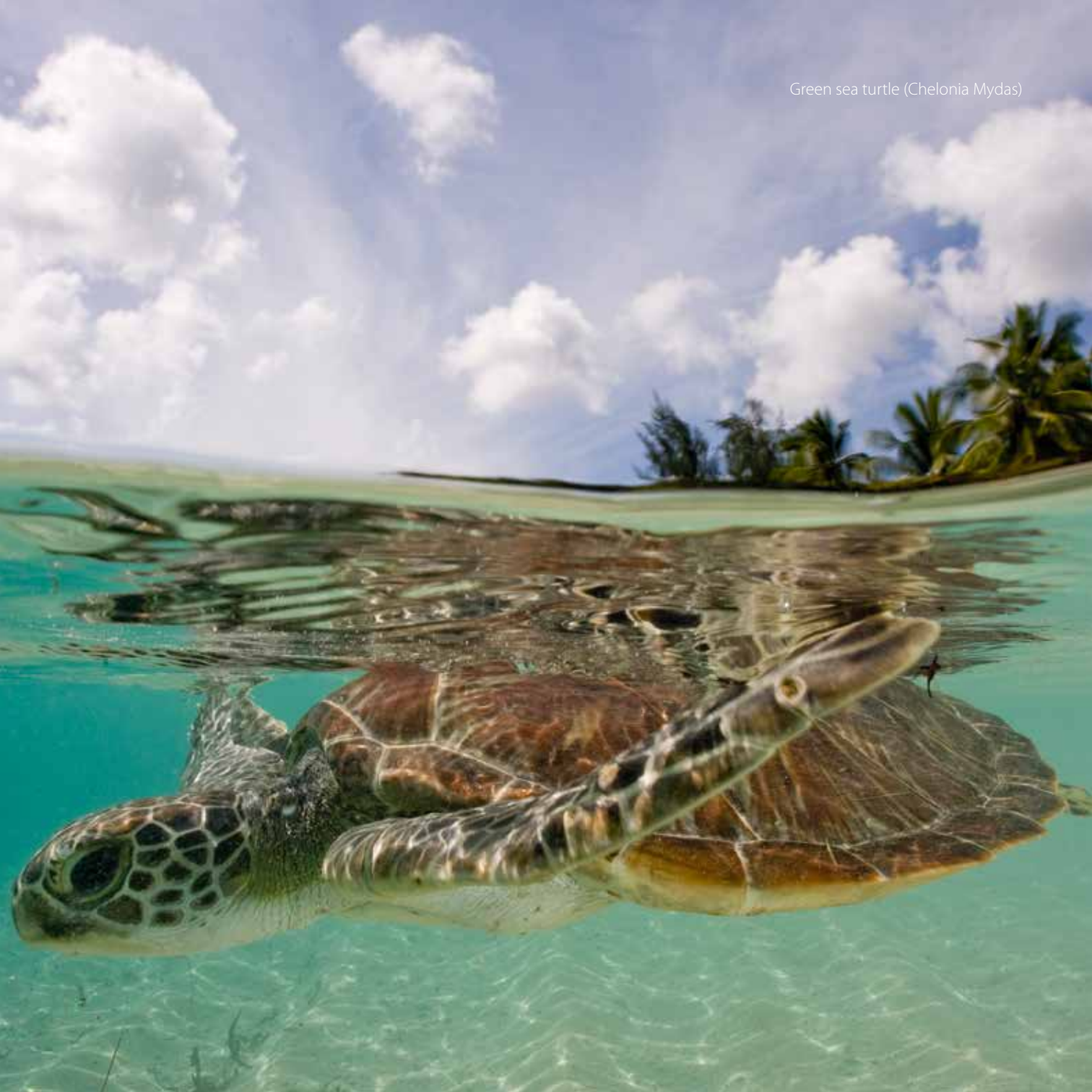
Green sea turtle ( Chelonia Mydas )