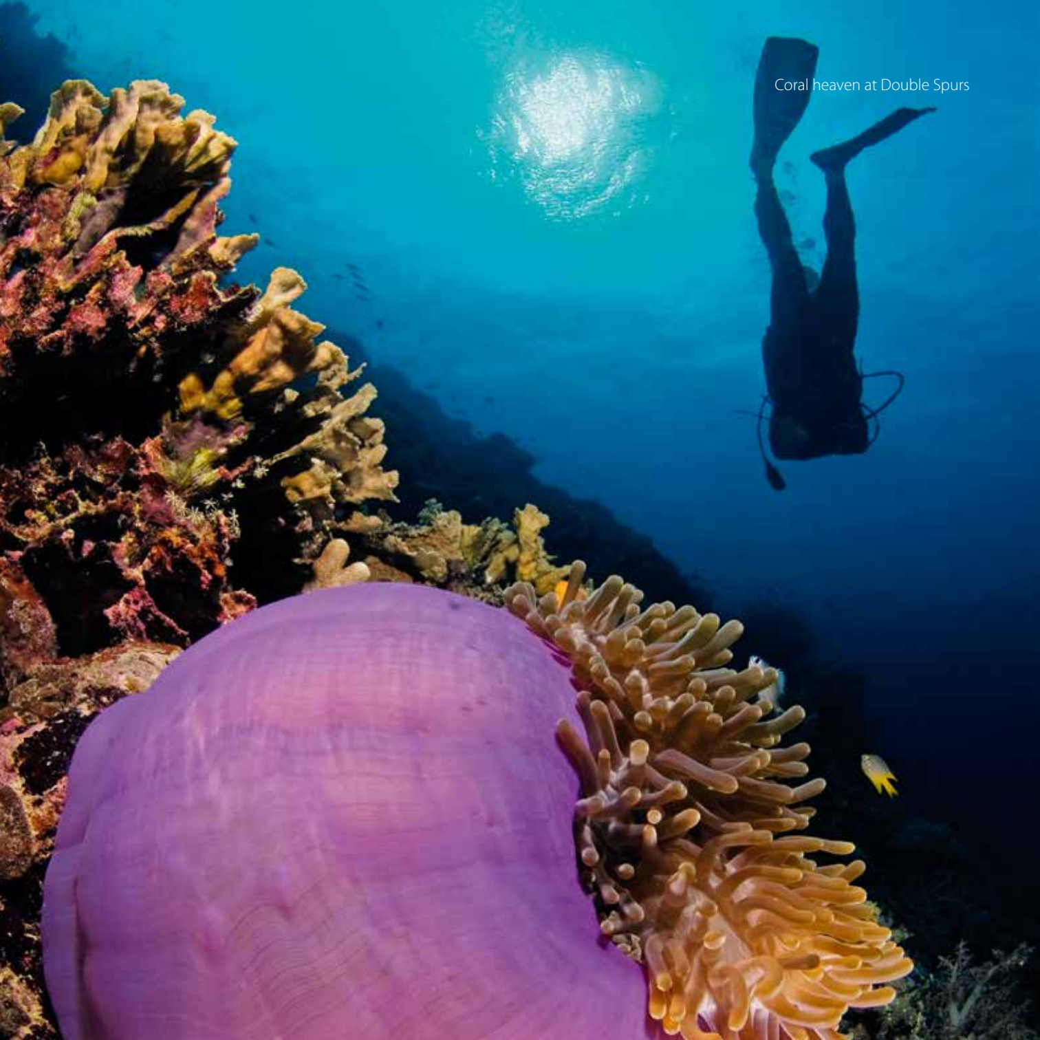
Coral heaven at Double Spurs