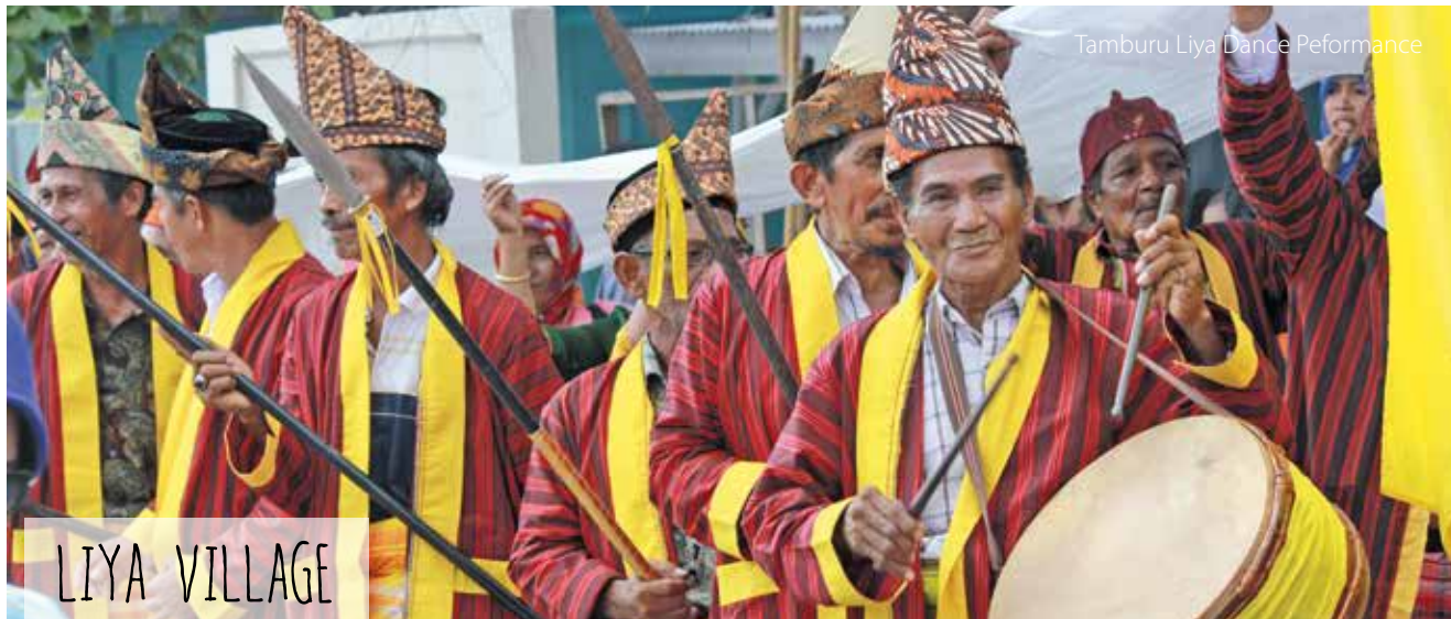
Tamburu Liya Dance Performance