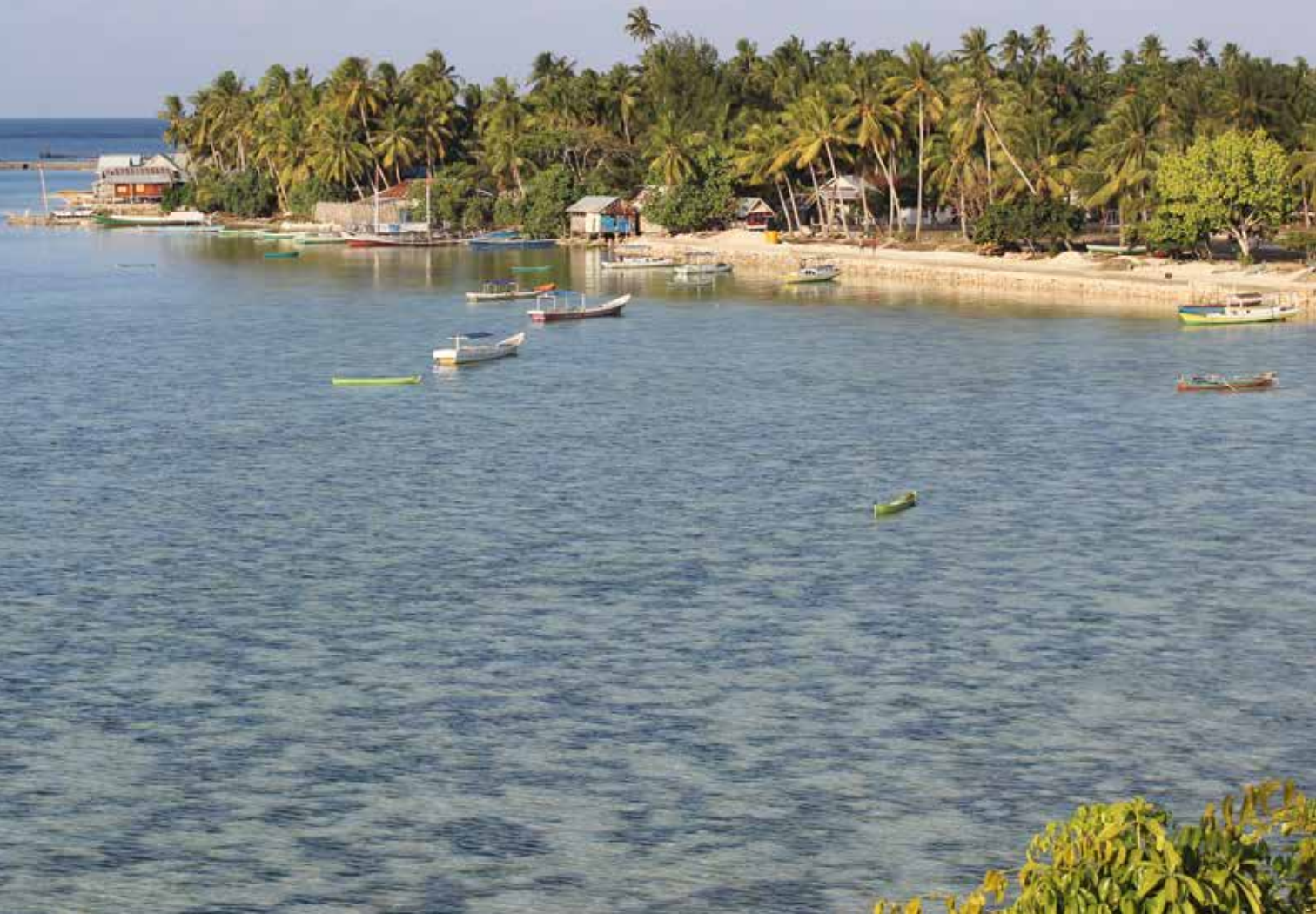
Coastal view of Tomia Island