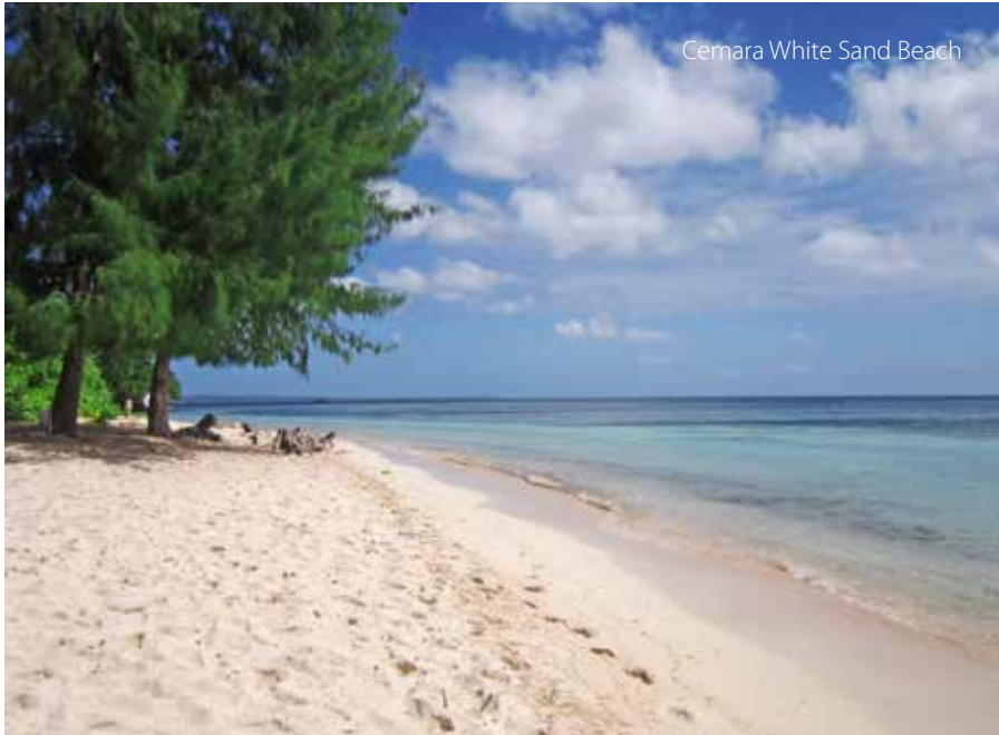
Cemara White Sand Beach