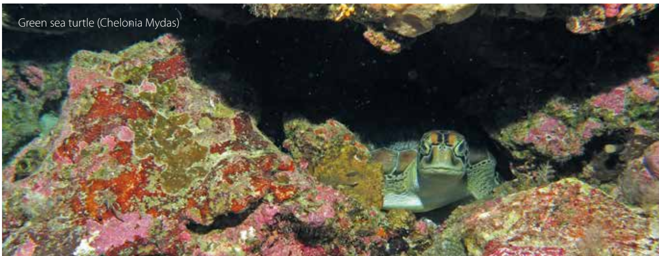
Green sea turtle (Chelonia Mydas)