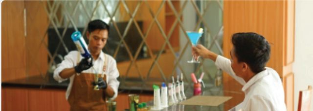
D III Cuisine Management