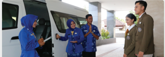
D IV Tour and Travel