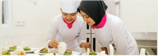
D III Culinary Arts