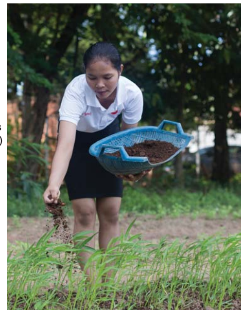
Vegetable planting activity at CJFTEC in Siem Reap